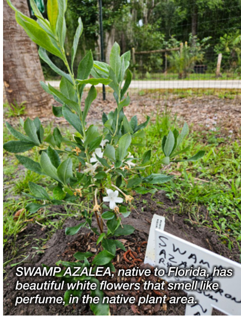
SWAMP AZALEA, native to Florida, has beautiful white flowers that smell like perfume, in the native plant area.