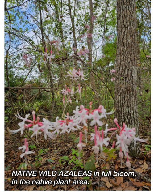
NATIVE WILD AZALEAS in full bloom, in the native plant area.