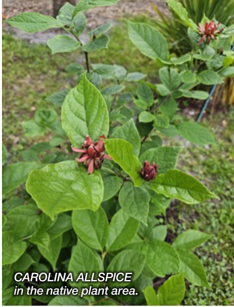
CAROLINA ALLSPICE in the native plant area.